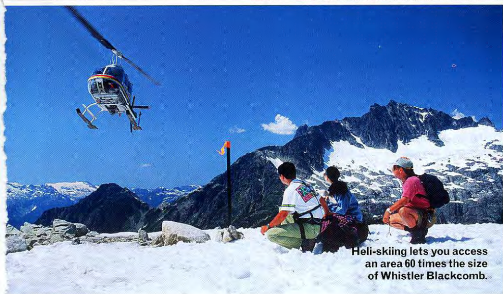
Heli-skiing lets you access an area 60 times the size of Whistler Blackcomb.

The program costs $AU180 per day. Visit www.whistlerblackcomb.com/rentals/schoolkids for more details.