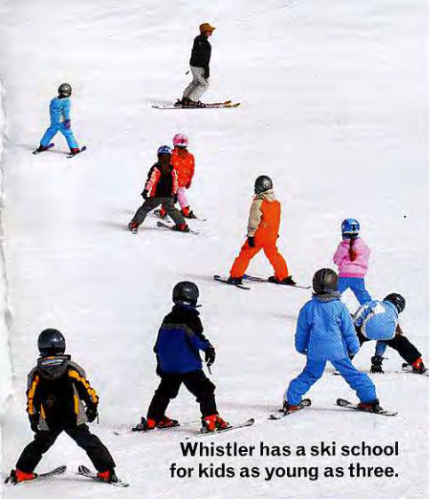
Whistler has a ski school for kids as young as three.