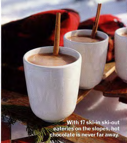
With 17 ski-in ski-out eateries on the slopes, hot chocolate is never far away.